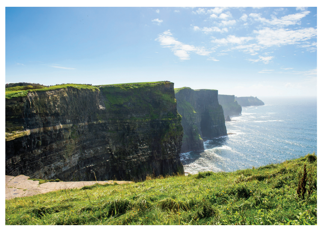
The sun shines down on the Cliffs of Moher, as we see on Day 7.

Dun Aenghus Fortress, the three prehistoric stone walls crowning the tallest cliffs of Inishmore; have lunch in a local pub; and enjoy some free time before returning to the mainland and our hotel late this afternoon. Dinner tonight is at a local restaurant in the village of Bearna. B,L,D