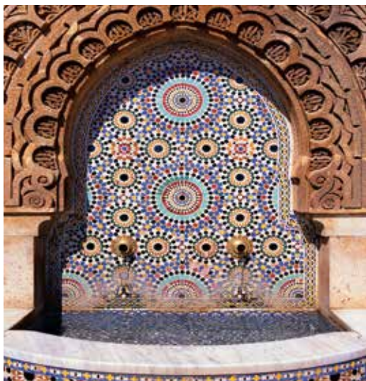
Traditional Moroccan tile work

Day 10: Ouarzazate/Ait ben-Haddou/Marrakech En route to Marrakech today, we stop first at uninhabited Ait ben-Haddou, a UNESCO World Heritage site and one of southern Morocco’s most scenic villages that is often used as a location for fashion and film shoots. Its old section consists of deep red kasbahs packed together so tightly they appear to be a single unit. Then, as we begin our descent from the High Atlas, we pass through typical villages with fortified walls and stone houses with earthen roofs. In Tizi N’Tichka, we traverse the Pass of the Pastures (alt. 7,415 feet), where life is much as it was centuries ago. We arrive in Marrakech late this afternoon and dine tonight at our hotel. B,L,D