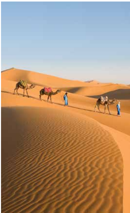
We ride camels in the Sahara.