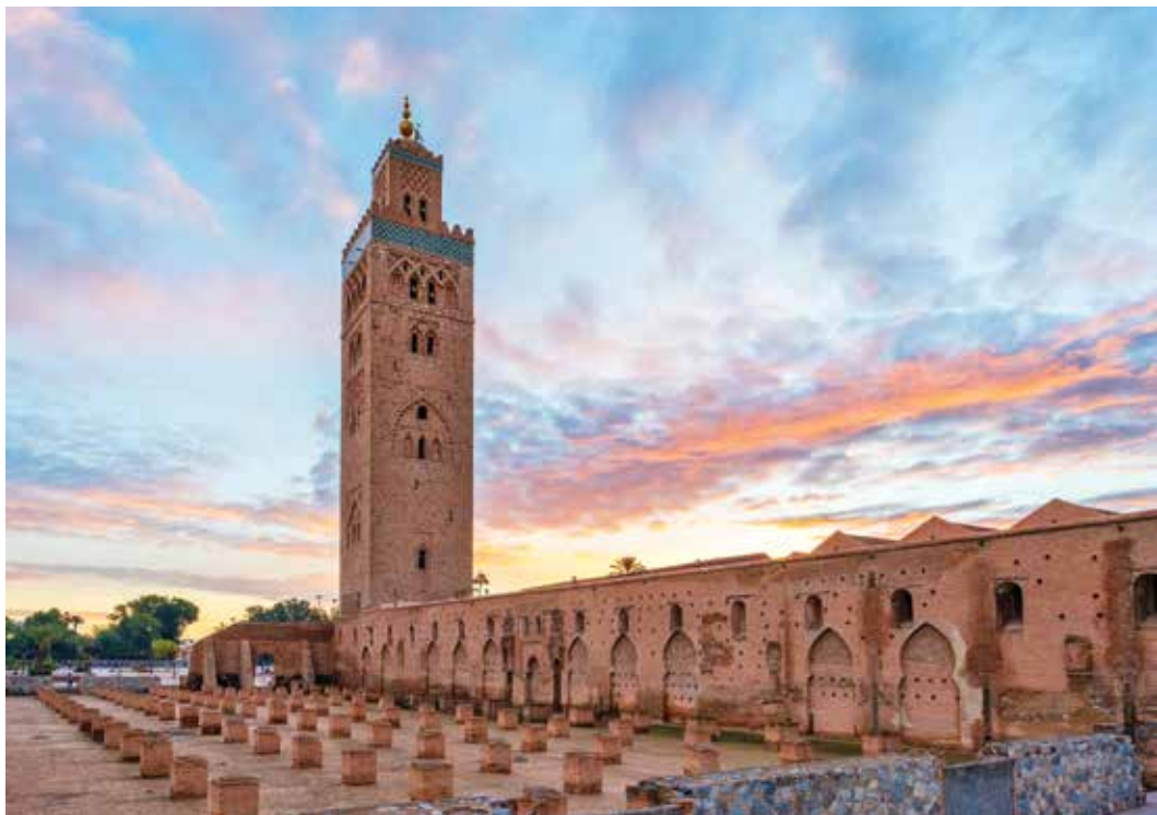
We see the distinctive Koutoubia Mosque – Marrakech’s largest – on Day 12.

where we see some hidden treasures, including the Blue Gate, the most picturesque of the Old City’s historic gates; the medieval school of Bouanania; the 12 th -century home of Jewish scholar Maimonides; and the authentic food market. The remainder of the afternoon is free for independent exploration and lunch on our own. B,L,D