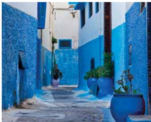
Rabat's Kasbah des Oudaias

Day 14: Depart for U.S. After breakfast this morning we transfer to the airport for our return flight to the U.S. B