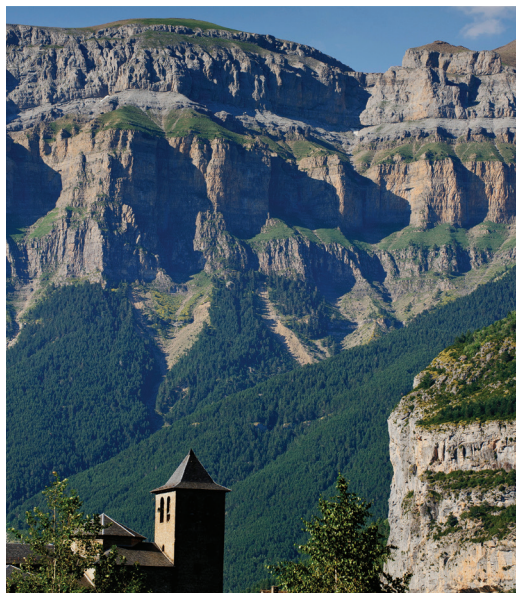
We spend two nights in the Pyrenees.

Day 16: Barcelona Our Gaudí tour continues this morning at Casa Mila, whose curving stone face inspired the nickname “La Pedrera” (stone quarry). Now housing a cultural center, Casa Mila is a UNESCO site. This afternoon is at leisure; tonight