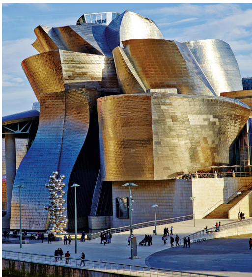
Bilbao’s iconic Guggenheim Museum

we bid ¡adios! to Spain, and to our fellow travelers, at a farewell dinner. B,D