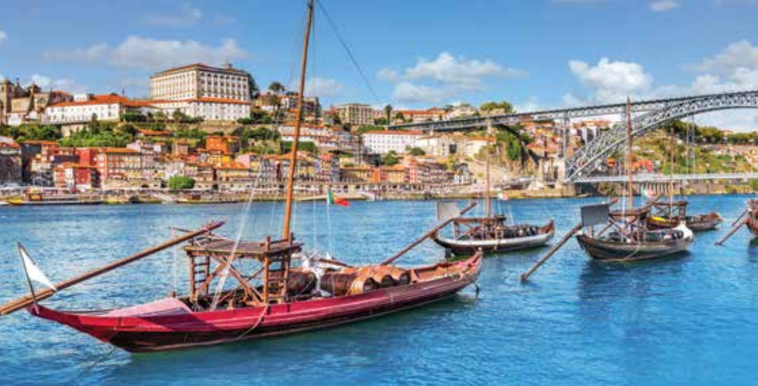
Flat-bottomed rabelo boats once transported casks of port wine along the Douro River to the lodges of Oporto.

from D-Day bombardments. Survey the serene English Channel and reflect on the commemorative crosses and Stars of David in the American Military Cemetery at Colleville-sur-Mer.