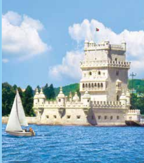
Watchmen surveyed Lisbon's harbor from the 16 th -century Tower of Belém.

Attend the Captain's Welcome Reception and Dinner this evening.