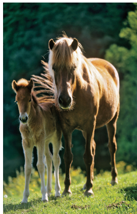
We may see wild horses while on our tour.

UNESCO World Heritage Site lying in a sprawling rift valley. Revered for its historical importance – this is where Iceland’s Althing, or national assembly, met in open-air sessions from 930 CE to 1798 – Thingvellir also sits on an active volcanic site at the spot where the fissure between the geological plates of North America and Europe is most evident in Iceland. It’s also a gem of nature, with canyons, caves, waterfalls, and ponds surrounded by snowcapped mountains. We learn about the historic parliament founded here in 930 CE, and walk along a gorge into the rift valley itself. Following our visit here, we head to a local farm for lunch, then depart for famed Great Geysir and Gullfoss, Iceland’s immensely popular “golden” waterfall. We continue on to Reykjavik, home to more than half of the nation’s population and ranking as one of the world’s safest