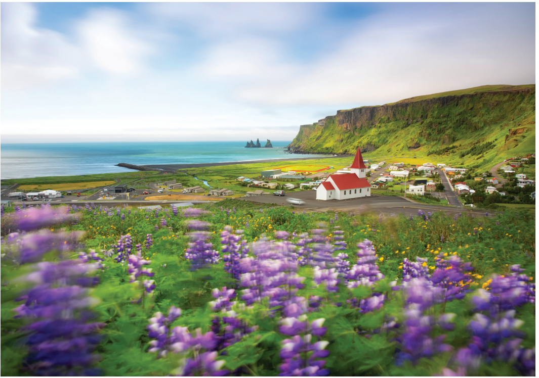
We spend days exploring the scenic Icelandic countryside.

towering walls; in the middle of the partially wooded canyon sits a hoof-shaped rock called “The Island.” Next, we visit Hljodaklettur Echo Cliffs, where we explore the labyrinth of “echoing rocks” created by the spiral basalt formations of the arches and canyons here. Our last stop: jaw-dropping Dettifoss, Europe’s most powerful waterfall and Iceland’s “Niagara.” B,L,D