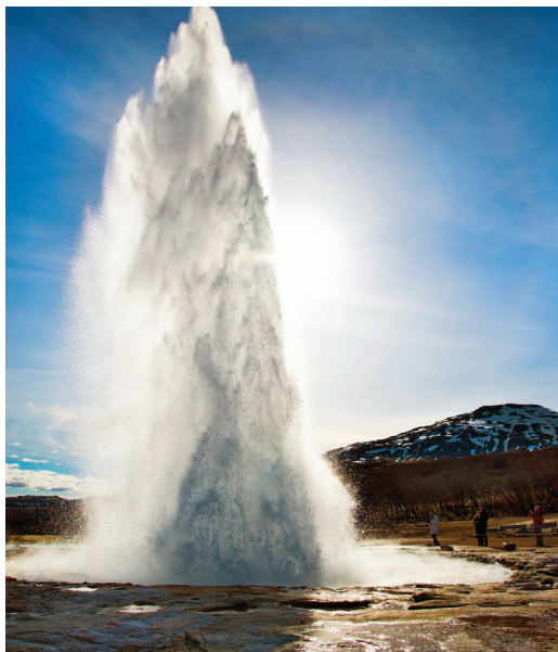
Iceland’s hot spring geysers are natural attractions.

architect Alvar Aalto. Those who wish can join in an optional tour to the Sky Lagoon. Tonight, we celebrate our adventure over a farewell dinner. B,D