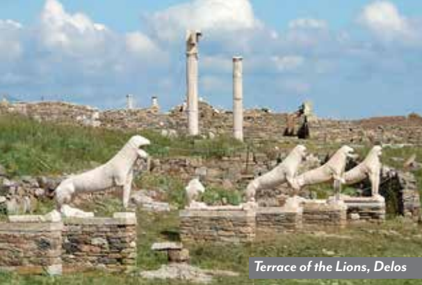
Terrace of the Lions, Delos