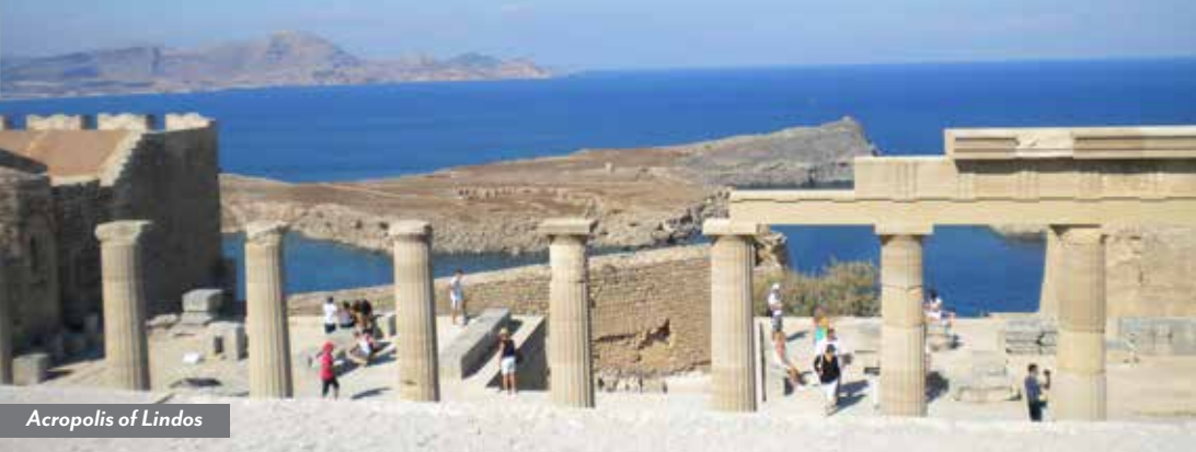
Acropolis of Lindos