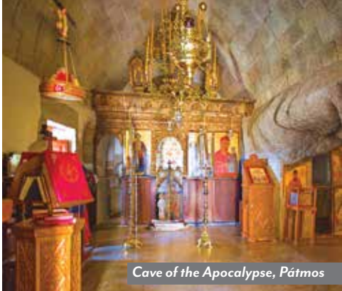
Cave of the Apocalypse, Pátmos

cliff-top acropolis or indulge in an afternoon at leisure in Rhodes. Enjoy a performance of traditional Greek music and dance this evening aboard the ship.