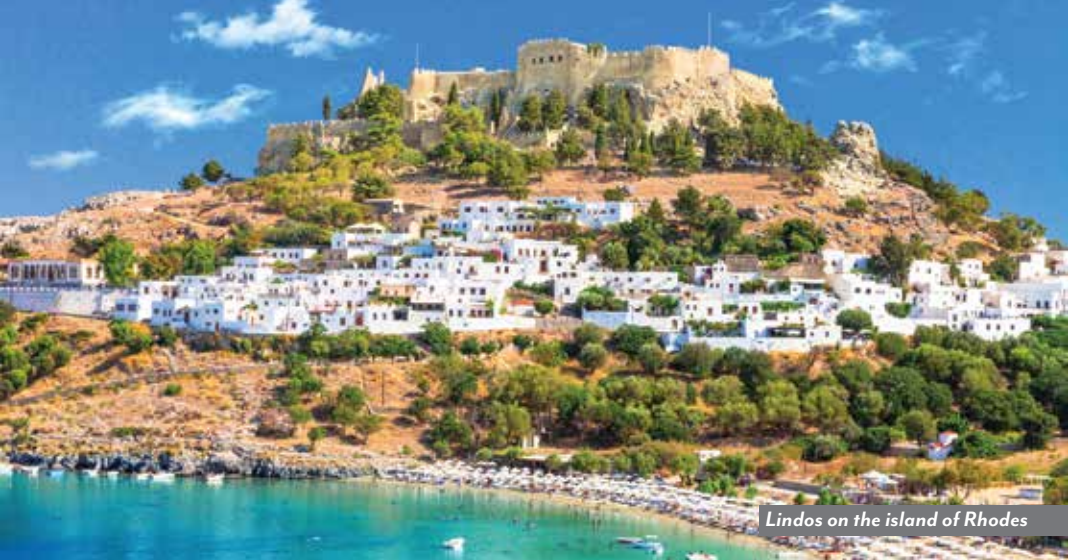
Lindos on the island of Rhodes