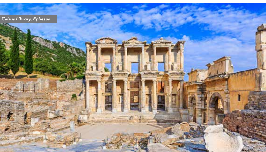
Celsus Library, Ephesus

Disembark and continue on the Thebes and Delphi Post-Program Option or transfer to the airport for your return flight home.