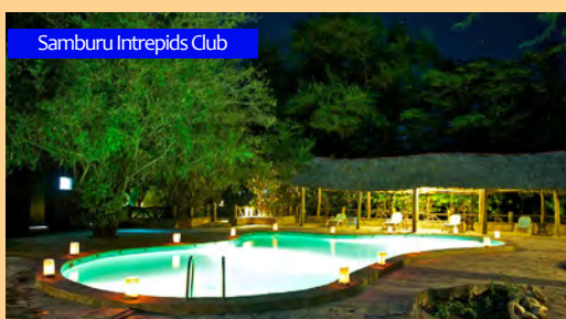
Samburu Intrepids Club