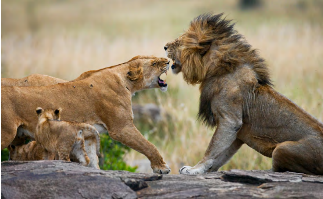
Adult lions demonstrate sparring to cubs