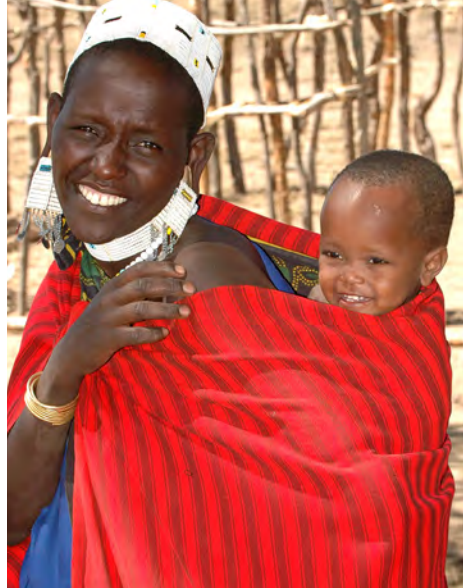
Maasai mother and baby