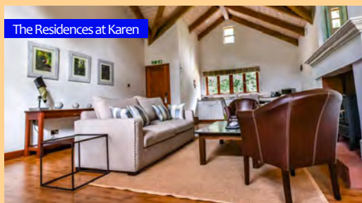
The Residences at Karen

Mara Intrepids Tented Camp: This luxurious tented camp combines upscale accommodations, gourmet dining, and warm hospitality in a stunning riverside location. Each classic African safari-style tent features a four-poster bed, vintage furnishings, and modern en-suite bathrooms with hot showers and flush toilets, ensuring a private and tranquil experience in nature.