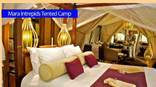
Mara Intrepids Tented Camp