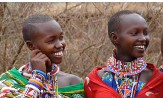
Maasai girls enjoying each other's company

Giraffe tongues are dark blue and measure around 20 inches in length. The length of their tongues allows them to browse for the very highest, juiciest leaves on their favorite acacia trees.