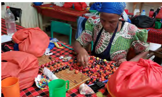
Local woman working at the the Kobe Tough Bead Factory