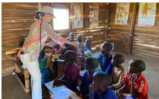
Engage with students and teachers during a school visit

"There is something about safari life that makes you forget all your sorrows and feel as if you had drunk half a bottle of champagne – bubbling over with heartfelt gratitude for being alive."