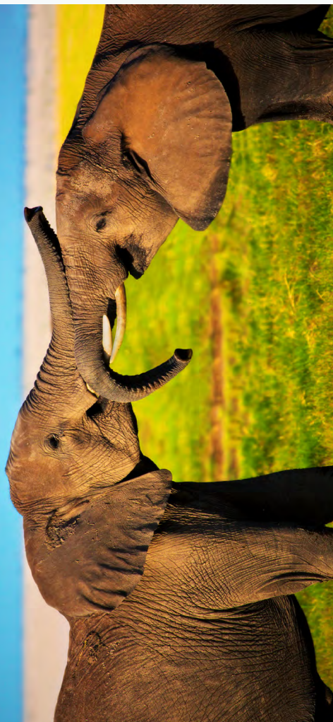
Classic Escapes protects our planet. ♻️

W&M Alumni Association Attn: Alumni Journeys PO Box 2100 Williamsburg, VA 23187