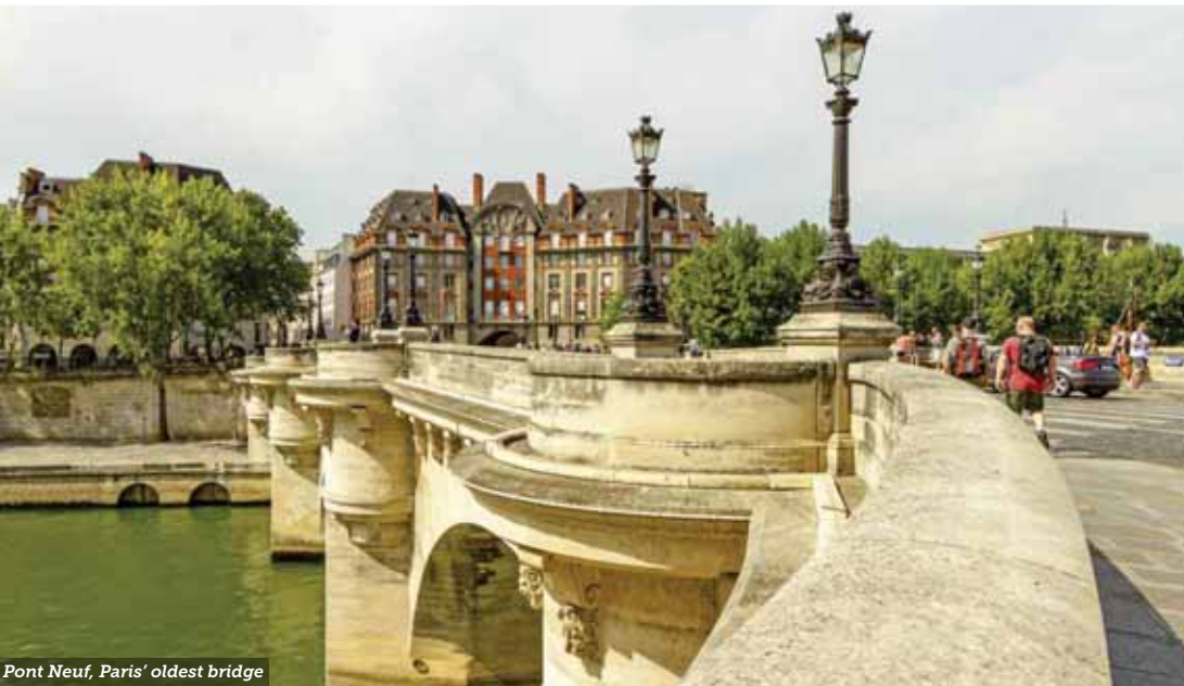
Pont Neuf, Paris’ oldest bridge