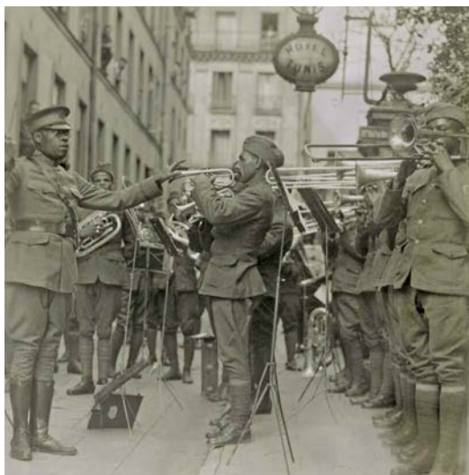
Top: Montmartre | Above: American military band plays jazz for wounded soldiers outside their Paris hospital, 1918

Explore the city that welcomed Josephine Baker, Langston Hughes and other African-American luminaries. See the favorite haunts of Hughes, W.E.B. DuBois and James Baldwin along the Champs Élysées, and drive through the Latin Quarter, so named because this neighborhood was the intellectual hub of Paris for centuries. Stroll through the artsy neighborhood where entertainers and writers from the African-American expatriate community lived, including Henry Ossawa Tanner, Miles Davis and Bud Powell.