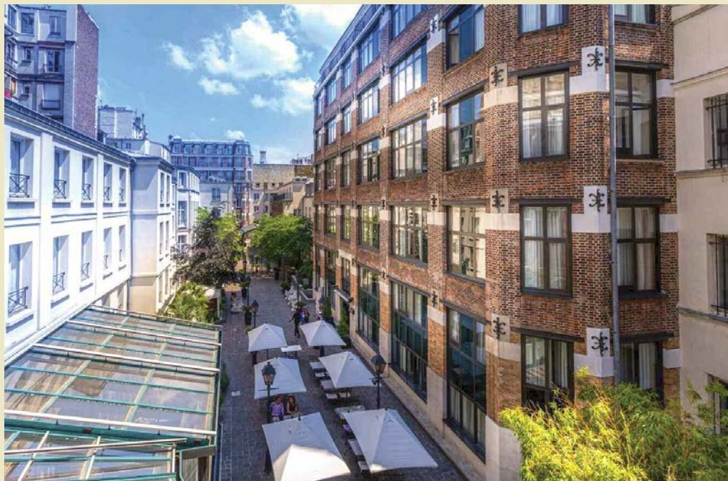
LES JARDINS DU MARAIS | PARIS