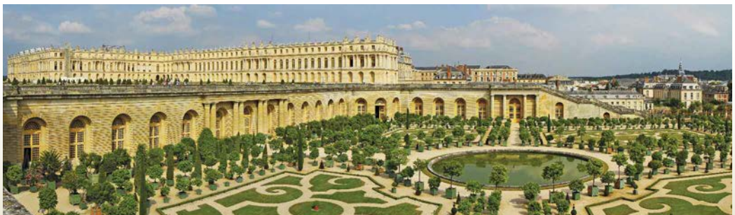
Optional excursion to Versailles