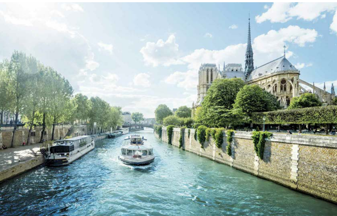
Cruising the Seine River

Discovery: The Left Bank. The African-American community, along with other communities of the African diaspora, flourished on the Left Bank. See where the Revue du Monde Noir , a groundbreaking magazine, was published, and learn about intellectuals, such as Anna Cooper and Carter G. Woodson. Born into slavery in 1858, Cooper earned a doctorate from the Sorbonne, and Woodson, who studied at the Sorbonne in the early 1900s, was a pioneer in the field of Black studies. Then delve deeper into the bebop style of jazz and the musicians who flocked to Paris to play their music. Plus, see where famous musicians, such as Miles Davis and Bud Powell, lived and performed.