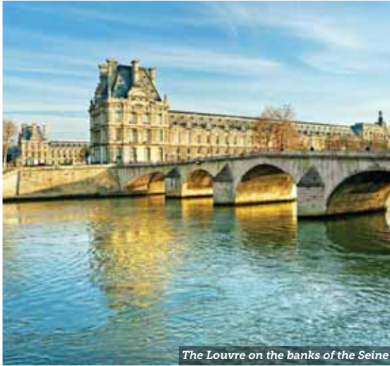
The Louvre on the banks of the Seine