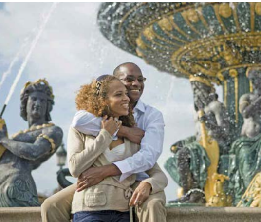
Free time to explore

🕒 Elective experiences available at an additional cost.