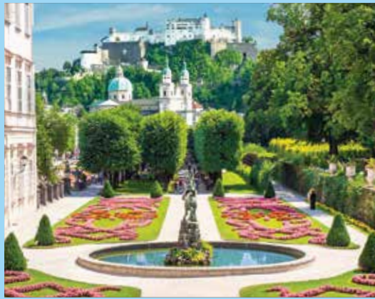
Stroll through the Baroque pleasure gardens of Mirabell Palace in the heart of Salzburg.

After lunch on board the ship, visit the UNESCO World Heritage-designated