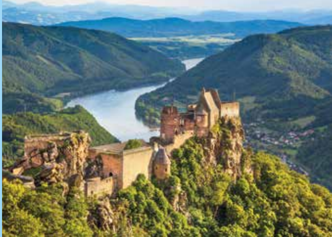
Cruise along the Danube River through the stunning natural beauty of the Wachau Valley landscape, a UNESCO World Heritage site.