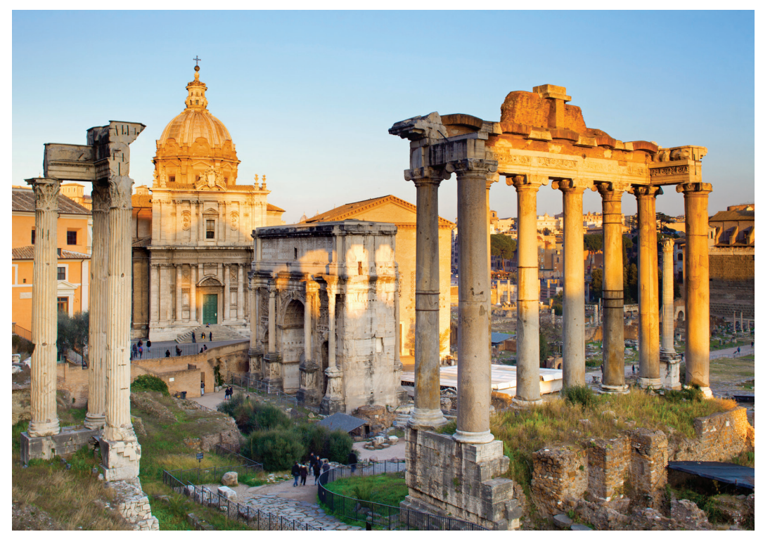
The Roman Forum dates to the 7th century BCE.

Day 7: Rome Another morning of touring followed by a free afternoon. Today we visit the Vatican for a tour of St. Peter's Square and Basilica, and the Sistine Chapel in the Vatican Museums. Highlights include Michelangelo's Pieta in St. Peter's, considered one of the greatest sculptures of all time; his frescoed ceiling of the Sistine Chapel, now restored to its original glory; and art-filled St. Peter's itself, the most important church in all Christendom. B