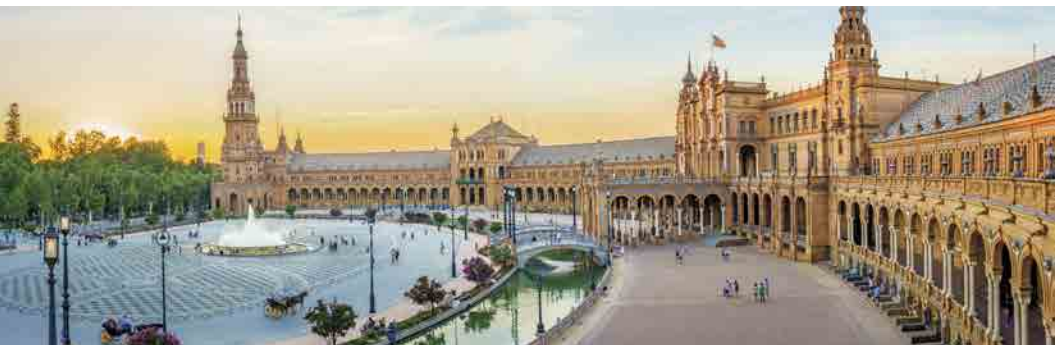
Plaza de España, Sevilla

Free Time: Spend the day in Antequera, or join one of today's activities.