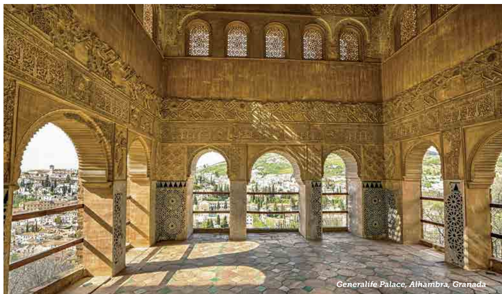
Generalife Palace, Alhambra, Granada