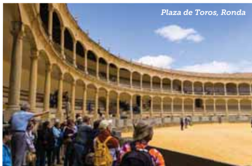
Plaza de Toros, Ronda