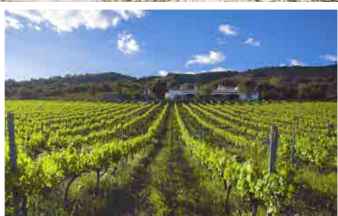
Bodega Joaquín Fernández, Ronda

Discovery: Córdoba. Explore La Mezquita, the exceptionally beautiful mosque-cathedral.