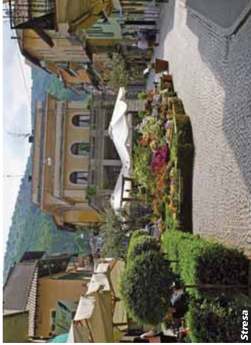
Near Maloja Pass