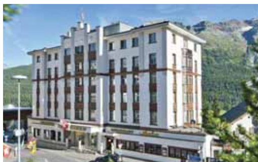
Hotel Schweizerhof, St. Moritz

BL|LD denotes included breakfasts, lunches and dinners.