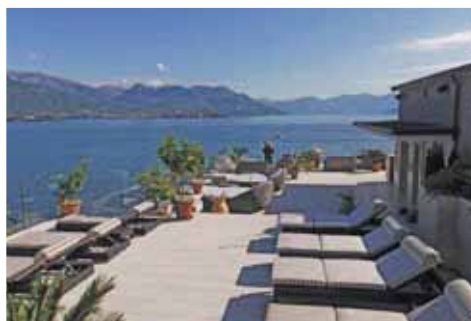
Hotel La Palma and Lake Maggiore, Stresa