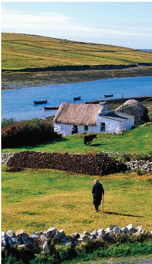
We spend Day 6 on the Aran Islands’ Inishmore.