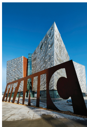
Titanic Museum, optional extension

tour of Kilkenny itself, noting the many buildings of “black” or Kilkenny marble, quarried locally. After lunch together at a local pub, the remainder of the day is at leisure. B,L